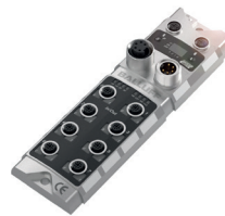
Fieldbus block for collecting the signals and transmission to the PLC over networks