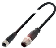
Sensor cable for connecting the sensors