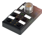
Passive distributors for collecting and consolidating the signals