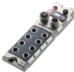
Network module for connecting to the controller