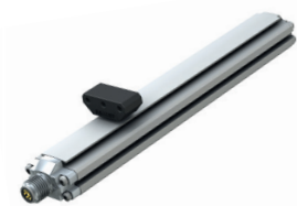
Precise magnetostrictive linear position sensor detects positions, travel and speeds.

With photoelectric measuring devices you determine the size and position of objects in the material flow of production lines. Neither the surface properties nor the color of the target object has any affect on the measuring quality.