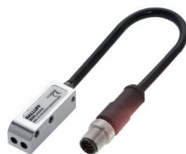
Precise, absolute and incremental magnetically coded travel and angle measuring system