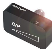
Inductive positioning system detects distances and positions at close range.