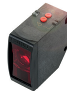
Photoelectric distance sensor measures distances regardless of color or surface properties of the object.

Each product technology has its own application focus areas: